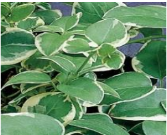
H: 4" Vinca Vine (purchase in quantities of 3)