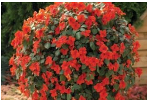
B: 10" Shade Basket: Impatiens for shady areas