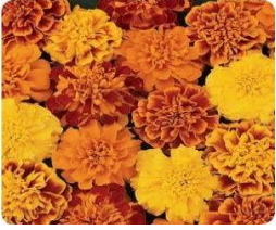
F: 4 Pack Flat of Marigolds (48 plants per flat)