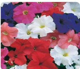
E: 4 Pack Flat of Petunias (48 plants per flat)