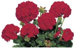
G: 4" Red Geraniums (purchase in quantities of 3)