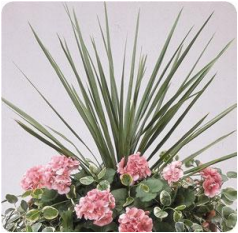
I: 4" Spikes (purchase in quantities of 3)