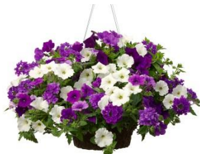
C: 10" Sun Basket: Mixed Annuals for sunny areas