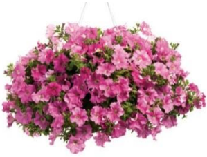
A: 10" Sun Basket: Trailing Petunias for sunny areas