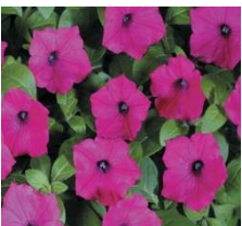
K: 4" Trailing Petunia: various colors (purchase in quantities of 3)

All plants grown and guaranteed by K&W Greenery, Inc. Delivery will be the week of 5/17/2021