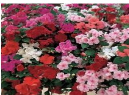
D: 4 Packs of Impatiens (48 plants per flat)