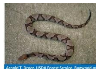
Arnold T. Drooz, USDA Forest Service, Bugwood.org

POISONOUS SNAKES: There are two poisonous snakes (Northern Copperhead and Timber Rattlesnake) that are occasionally found in Fayette County, Indiana. The Northern Copperhead (left below) is a moderately sized, stout-bodied, venomous snake that typically measures 24 to 36 inches in total length. Its head is reddish-brown in color and its body is tan. The body is marked with 15 to 19 mahogany lateral bands with darker edges that are wide on the sides and narrow on the back. The color pattern of the Timber Rattlesnake (right below) is highly variable, with ground coloration ranging from yellow and brown, to gray or black. All Tiber Rattlesnakes do, however, possess dark, often chevron shaped, cross bands along the dorsal surface. This venomous snake is a large stout-bodied snake that can reach lengths of 50 to 60 inches. They also possess a rattle on their tail.