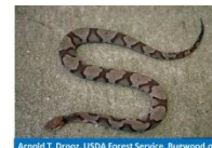
Arnold T. Drees, USDA Forest Service, Bugwood.org

POISONOUS SNAKES: There is one poisonous snake (Northern Copperhead) that is occasionally found in Marion County, Indiana. The Northern Copperhead is a moderately sized, stout-bodied, venomous snake that typically measures 24 to 36 inches in total length. Its head is reddish-brown in color and its body is tan. The body is marked with 15 to 19 mahogany lateral bands with darker edges that are wide on the sides and narrow on the back. Viewed from above, the patterning on the back appears hourglass shaped, though the blotches are occasionally interrupted along the midline. Additional, irregular brown spots are found between the "hourglasses." The copperhead has a wedge-shaped head, sensory pits, and vertically elliptical "cat-like" pupils.